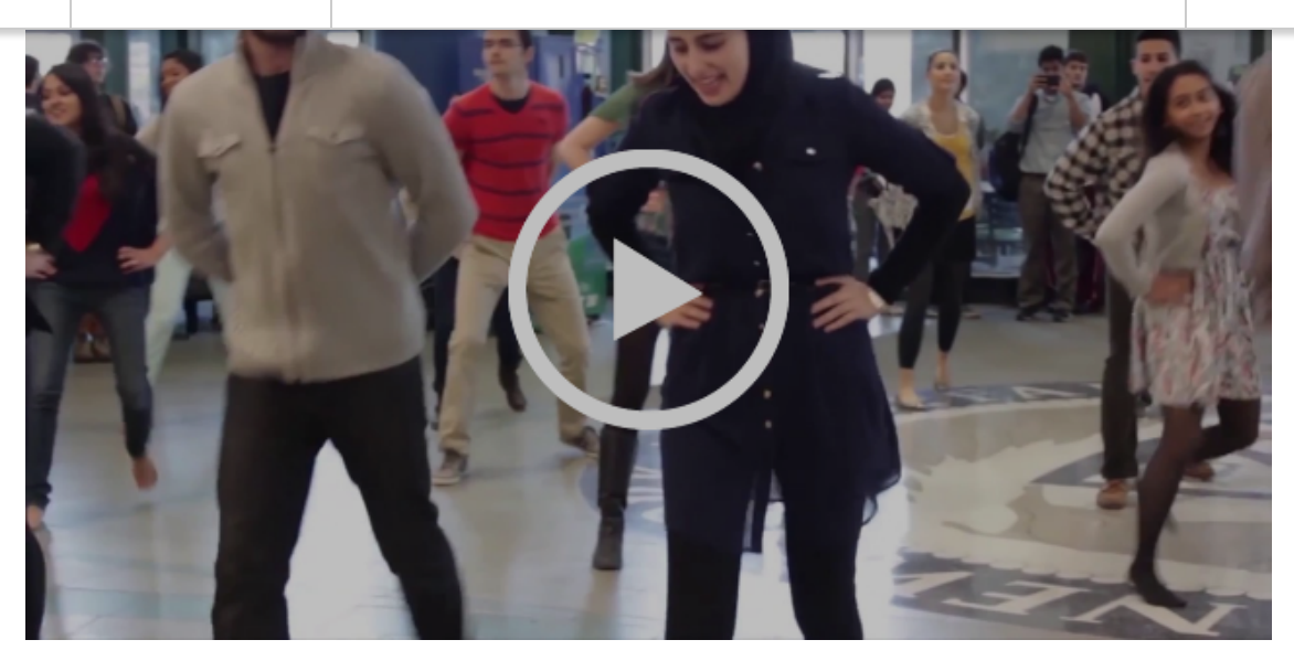
WNYMuslims' Promo 2018