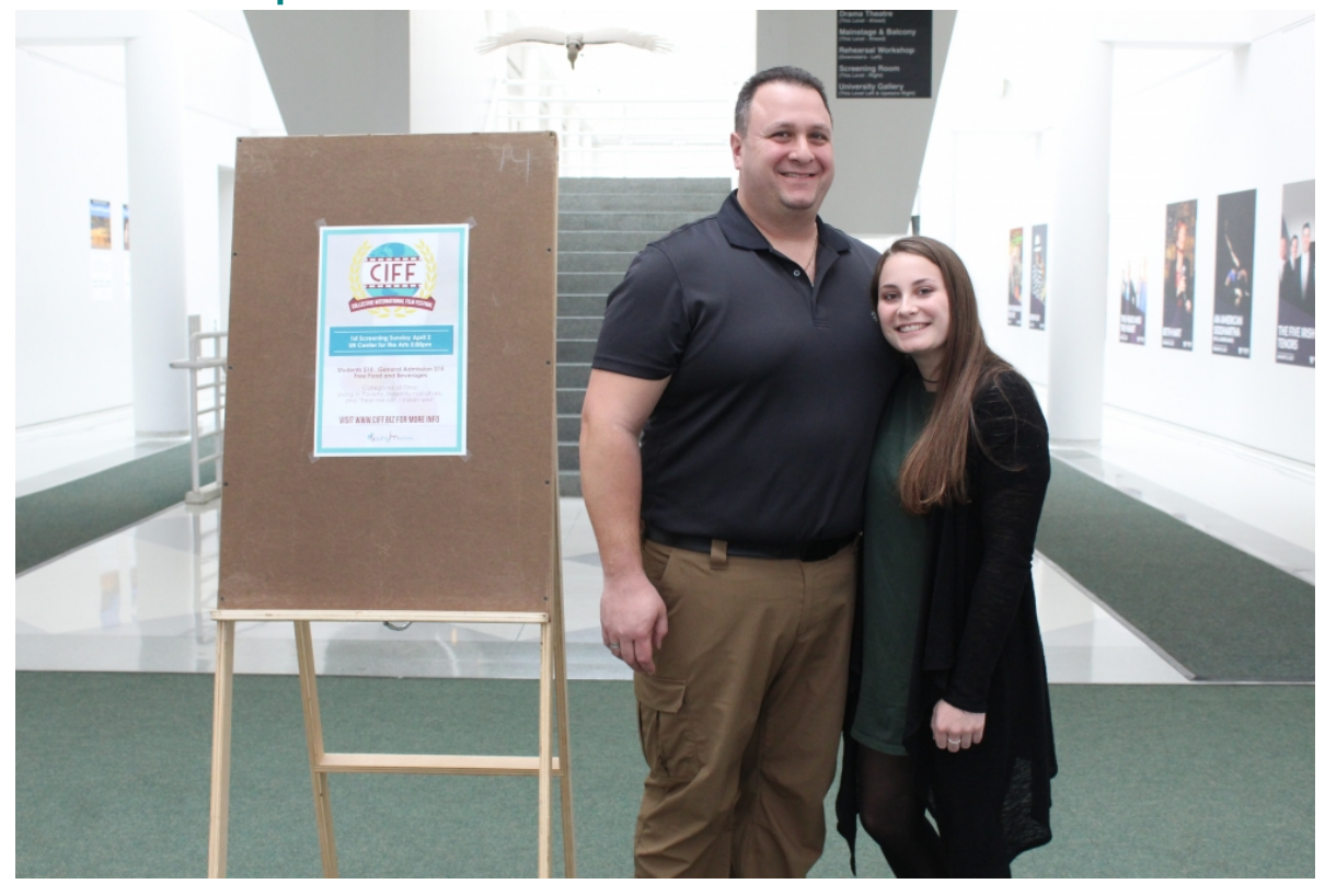
04/02/17 11:08pm | By BENJAMIN BLANCHET

WNYMuslims presents Collective International Film Festival at UB