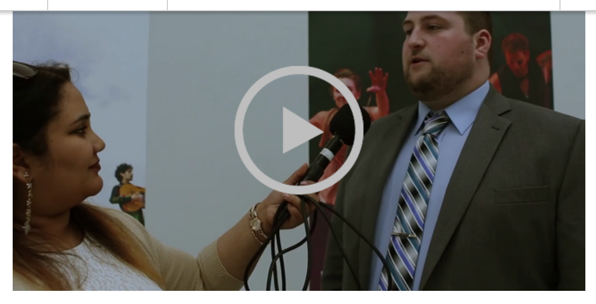
CIFF First Screening at UB Center of Arts on April 2nd, 2017