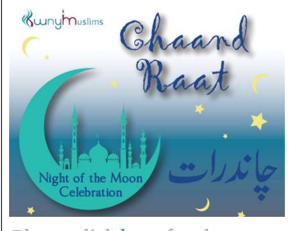
Please click here for the event