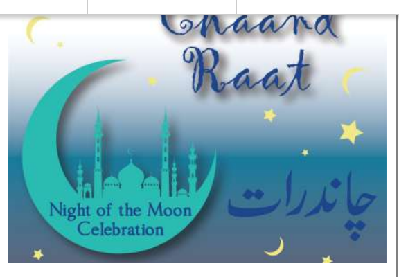
Please click <u>here</u> for the event coverage.