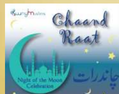
Chaand Raat Event Coverage Eid ul-Fitr 2023