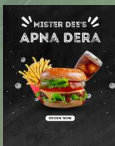
Mister Dee's Apna Dera Restaurant