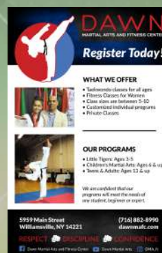
Dawn Martial Arts and Fitness Center