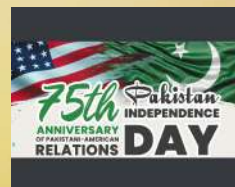
Pakistan Independence Day

For more details please click on the thumbnails.