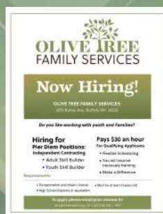
OTFS is Hiring