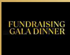
Fundraising Gala Dinner