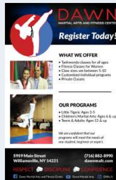
Dawn Martial Arts and Fitness Center