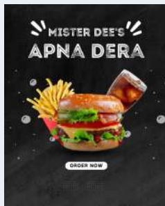
Mister Dee's Apna Dera Restaurant