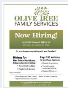
OTFS is Hiring