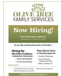
OTFS is Hiring