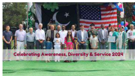
Celebrating Awareness, Diversity & Service 2024