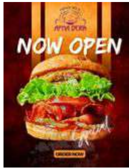
Apna Dera & Mister Dee's Restaurant