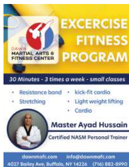
Dawn Martial Arts and Fitness Center