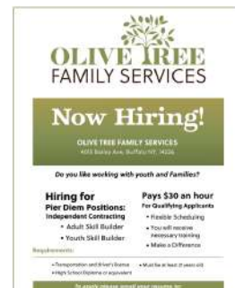
OTFS is Hiring