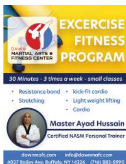
Dawn Martial Arts and Fitness Center