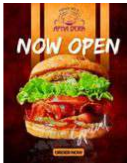
Apna Dera & Mister Dee's Restaurant