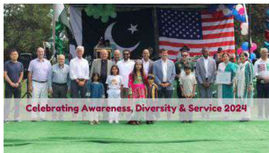
Celebrating Awareness, Diversity & Service 2024