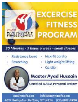
Dawn Martial Arts and Fitness Center