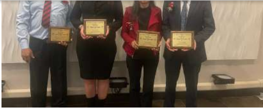
Celebrating Community Champions at the NRC 41st Annual Appreciation Dinner