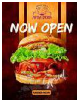
Apna Dera & Mister Dee's Restaurant