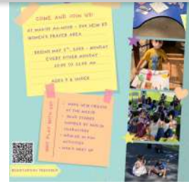
The Mighty Muslims Bi-weekly on Mondays