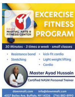
Dawn Martial Arts and Fitness Center