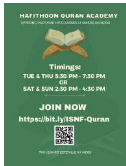
ISNF Hafithoon Quran Academy Registration for Spring 2025