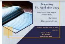
The Tafseer Dars Fridays @ 8:00 PM