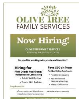
OTFS is Hiring