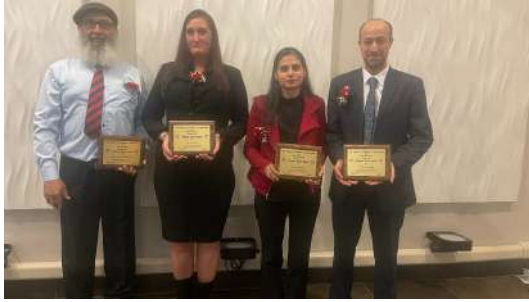
Celebrating Community Champions at the NRC 41st Annual Appreciation Dinner