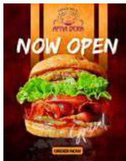
Apna Dera & Mister Dee's Restaurant