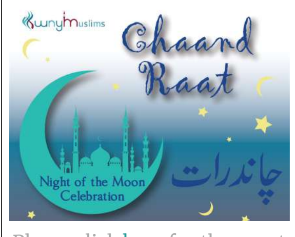
Please click here for the event