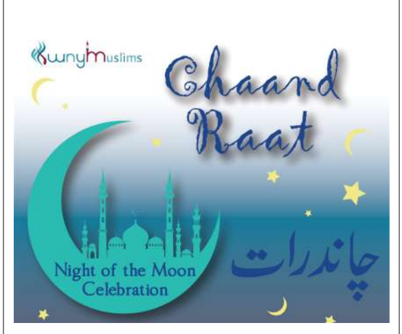
Please click <u>here</u> for the event coverage.