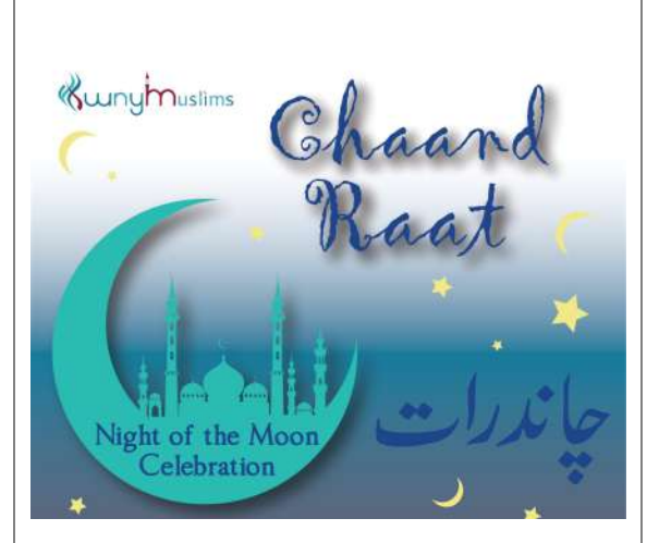
Please click <u>here</u> for the event coverage.