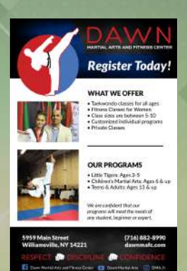
Dawn Martial Arts and Fitness Center