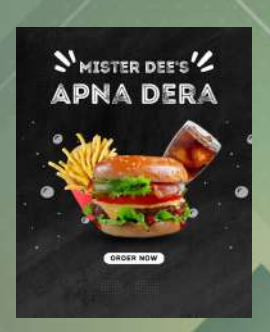
Mister Dee's Apna Dera Resturant