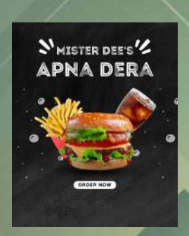
Mister Dee's Apna Dera Resturant