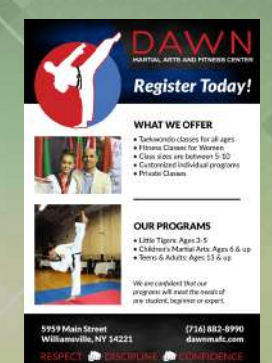
Dawn Martial Arts and Fitness Center