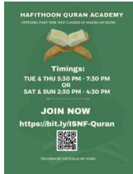
ISNF Hafithoon Quran Academy Registration for Spring 2025