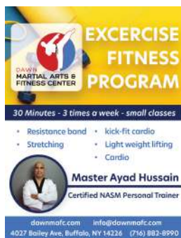
Dawn Martial Arts and Fitness Center