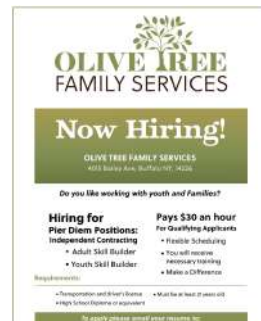
OTFS is Hiring