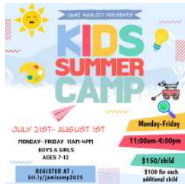
Kids Summer Camp Monday-Friday