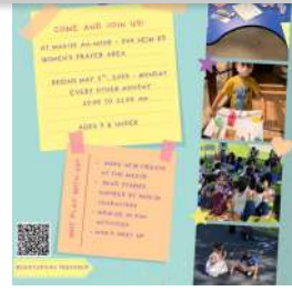
The Mighty Muslims Bi-weekly on Mondays