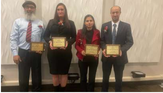
Celebrating Community Champions at the NRC 41st Annual Appreciation Dinner