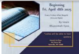
The Tafseer Dars Fridays @ 8:00 PM