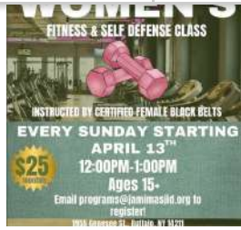
Fitness & Self-Defense Class for Sisters Every Sunday