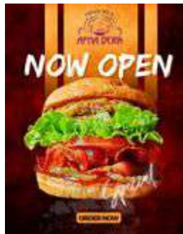
Apna Dera & Mister Dee's Restaurant