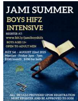
Jami Boys Hifz Program July 01, 2025