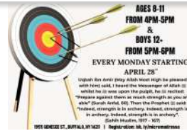
Kids Archery Every Monday